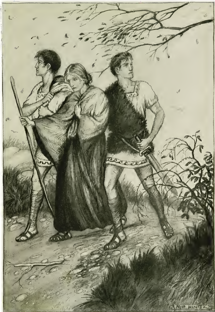
It grieves me to think of them, still keeping up that weary pilgrimage